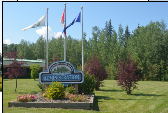
MD of Lesser Slave River No. 124