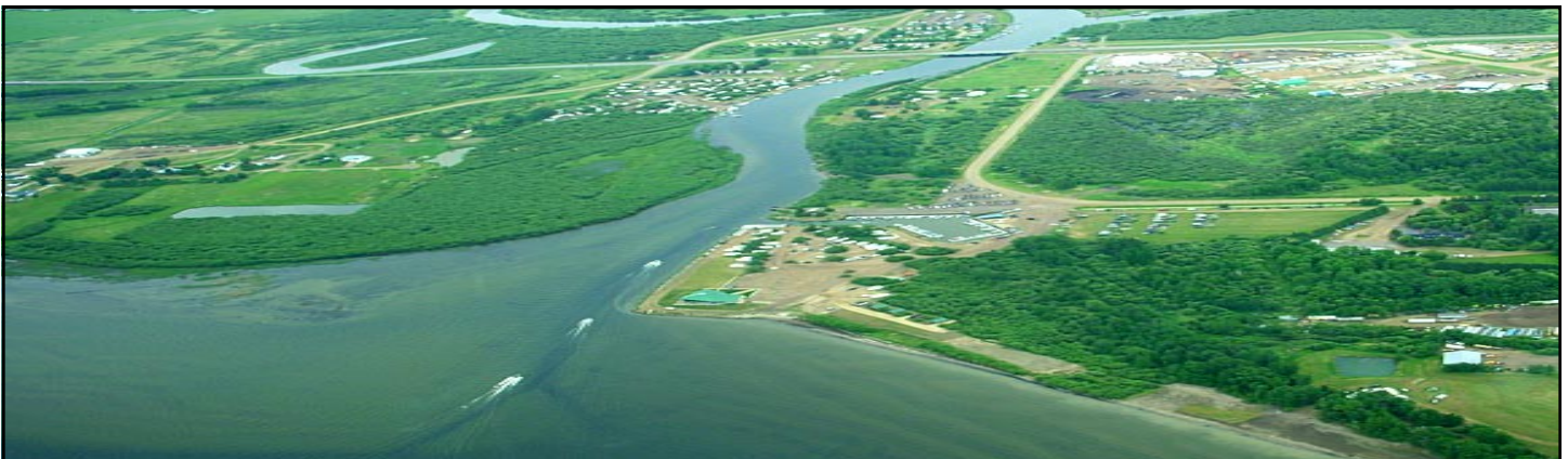
Lesser Slave Lake outlet into Lesser Slave River

This document is based upon the interviews and community fieldwork completed in the Slave Lake region in the first year after the wildfires. The purpose is to share the lessons learned related to the recovery of the community and its citizens. Findings from the school and household survey are available in other reports; see ruralwildfire.ca .