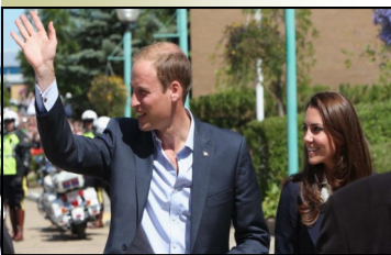
Their Royal Highnesses, The Duke & Duchess of Cambridge

In the Slave Lake area, the three elected councils of the three local authorities worked together during the disaster and recovery of their communities. They worked with the ESRD personnel, local firefighters and other personnel sent in to assist in the fire fighting efforts. Outside consultants were hired to address a multitude of tasks and assist in the recovery efforts.