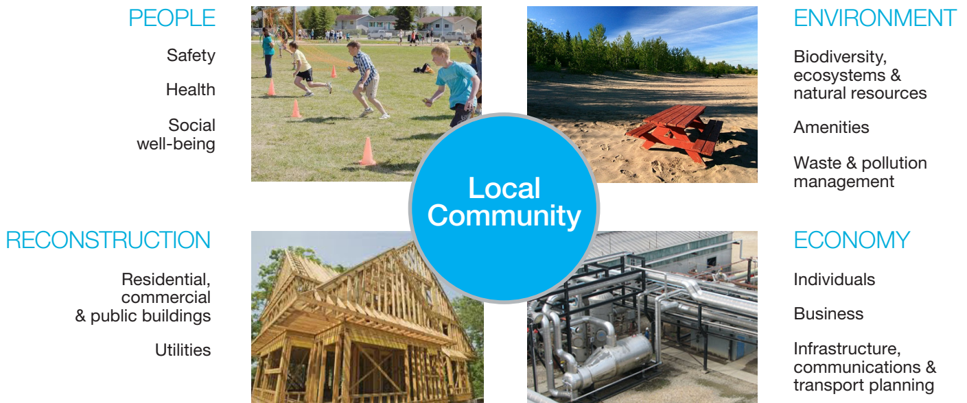
Figure 4 Recovery Framework

the centre of each element and provides the lens through which all aspects of recovery are viewed. This approach embraces the regional community’s cultures, values, objectives and goals.