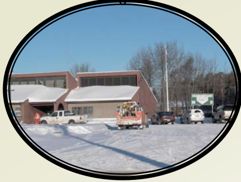
Town of La Ronge