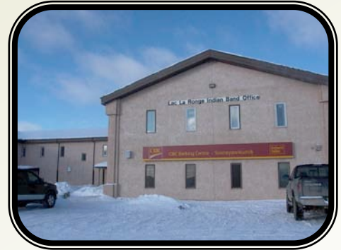
Lac La Ronge Indian Band