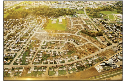
By early September, most of the debris in the town's most devastated area, the southeast region, was cleared.

The road access saga of an isolated property east of Smith finally concluded when members of M.D. #124 council voted in favour of allowing the owners access via an M.D. road allowance. It was an option council did not want to pursue, but members were left with little choice on the matter.