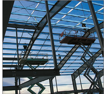
Slave Lake's field house was progressing nicely.

Town councillors expressed outrage at the devel-