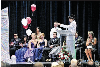
Roland Michener's graduation was a hit, and after the convocation, students invited community members for a free barbecue.

M.D. property owners, on the other hand, had been building since July because they had fewer issues to deal with than the town.