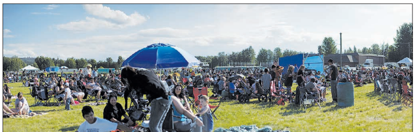
The Concert of Hope weekend at the Widewater ball field was a lively place, filled with concessions, music, people and a beer garden.