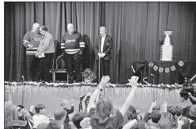
The Stanley Cup in Slave Lake was a major December highlight.

Operation Christmas Cheer was in full flight on Dec. 4. Gifts, decorations and Christmas carolers made its way to trailer courts in Phoenix Heights, Sunset Place and The Point.