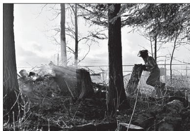
The most visible FireSmart activity was a work bee held on Dec. 7. A work bee is local people pitching in to help perform a task. A crew of about 30 government workers and civilians took part thinning the forested areas along Birch Road.

Living Waters School Division administrators asked town council to help the school board lobby the provincial government to have a section of Hwy. #2 – the two Cornerstone intersections – be designated as a school zone. Council asked town administrators to explore options.