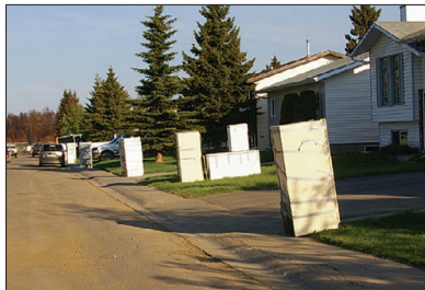
Homeowners left their refrigerators and freezers outside for garbage pickup since two weeks without power produced a lot of spoiled food.

As to why Slave Lake was not evacuated prior to the fire actually entering town, the official word was that until it actually started happening – apparently due to a shift in wind direction – it seemed as if the