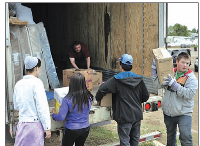
In June, donations began pouring into Slave Lake by the truckload.