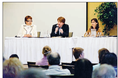
Slave Lake residents heard federal election candidates debate during an April 27 forum.