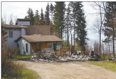
The fire that hit the South Shore area was quite selective, sometimes burning a shed but leaving the house, sometimes the opposite. Some buildings were also saved by firefighting efforts.

It actually happened in April, but the first report in The Leader about a major pipeline break near Little Buffalo, northwest of Slave Lake, appeared in May. The report had to do with concerns of local residents about health effects from fumes from the crude oil released onto the landscape. The size of the leak was estimated at 28,000 barrels.