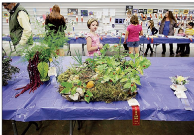
The annual Smith-Hondo Fall Fair during the Labour Day weekend was, as usual, colourful and entertaining.

Also graduating from high school were three students from Slave Lake Koinonia Christian School on Aug. 21. The ceremony was considered to be a major milestone because the graduates were the first to receive their diploma in the new school building and the first to graduate after a major disaster.