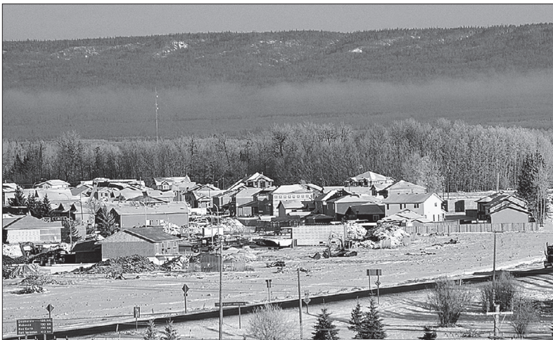
If Slave Lake residents want a rebuild then they will get it. By late November, the southeast part of the town was beginning to look a lot like pre-fire Slave Lake and not the dirt patch seen earlier in this review.