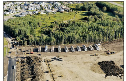
The first set of interim mobile homes at Sunset Place were planted in mid-September, but they were not ready for occupancy until later in the month.

In its Sept. 22 announcement, oilfield service company CCS donated $100,000 to the Arena Fundraising Committee to help the Slave Lake arena complete its project. CCS and E.G. Wahlstrom School organized a shootout hockey game in the gymnasium.