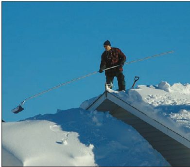
Heavy snow in January had some people on their roofs cleaning it off.

The front page of the first issue of The Leader in 2011 did not – as one might expect – feature the first baby born in Slave Lake in the New Year. That was a bit late in coming, so we ran a photo of a pair of skiers from out of town, enjoying the deep snow and pristine forest landscape on the Nine Mile trails near Widewater. Exactly a year after that photo was taken, there not only wasn't any snow to speak of, that forest was a black shadow of its former self.