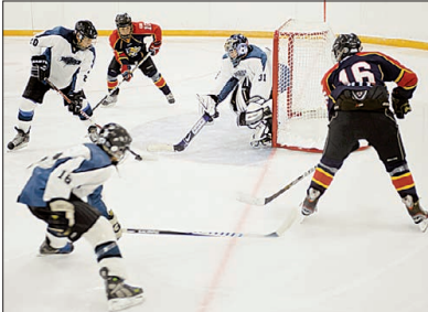
Arena 2 was the first to open at the Arctic Ice Centre, and the first minor hockey league games were played on the weekend of Oct. 14.

Greyhound's passenger service ended on Oct. 24. The company cut services to Slave Lake because it was unprofitable. A High Level bus firm, Northern Express, currently fills the service gap left by Greyhound.