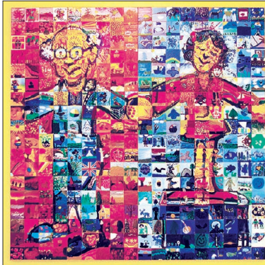
On the arts side, the Pubble People mural, created by 324 local contributors, was revealed on Jan. 27 at the government building.