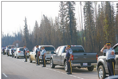
The police salute to the out-of-town fire crews as they leave the Slave Lake area.

There was a bit of flooding in areas east and west of Slave Lake in the third week of June. Nobody knew it at the time, but it was a sign of much worse to come. And it didn't take long for worse to come. A heavy downpour on June 24 caused streets and some basements - mostly in the northeast part of Slave Lake - to flood.